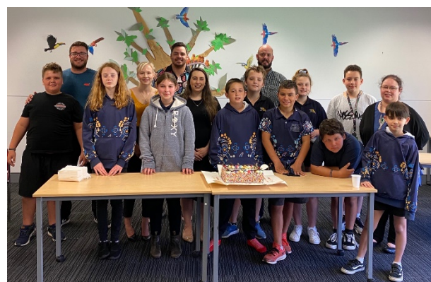
Yr 5&6 students at Robotics last week...