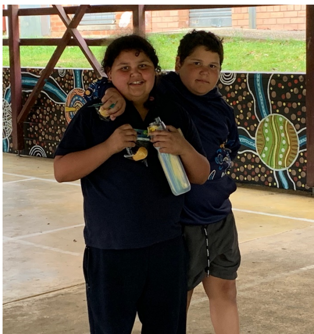
Student banking rewards...