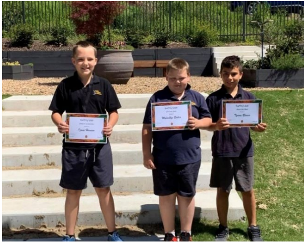
NAIDOC Award winners