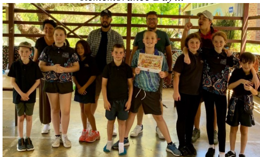
Koori Cook-off winners...