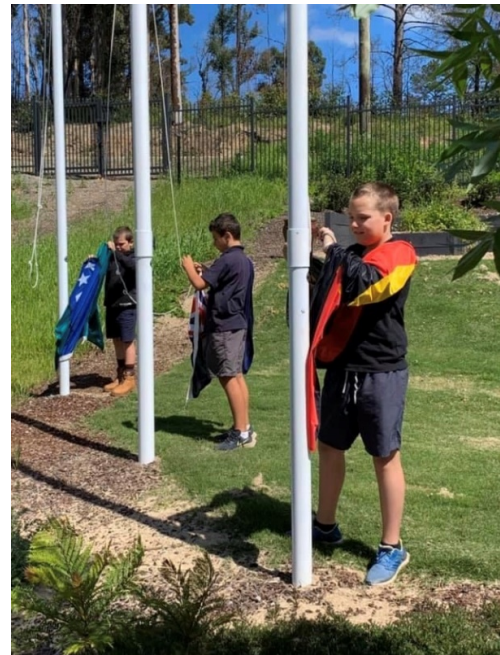
Flag raising ceremony...