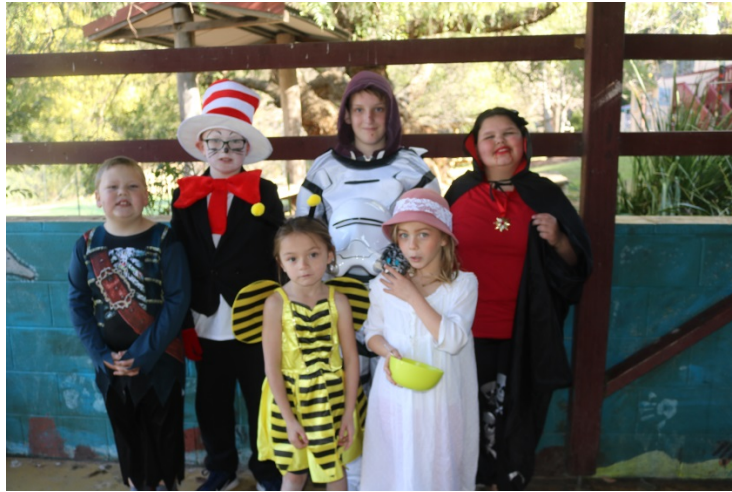
Book Parade Winners...