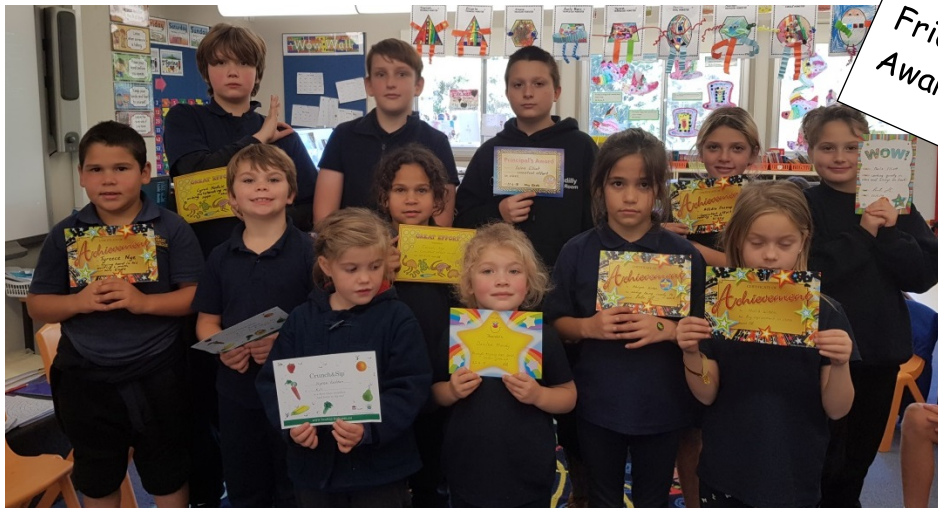
Friday Assembly Award winners