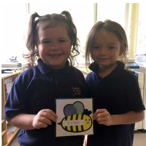
Be a learner...

Book club money and orders due Tuesday, 27 March.